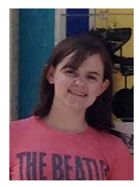
Why do you believe in God?

It's a fair question, I suppose. Why believe in something you can't see or touch?