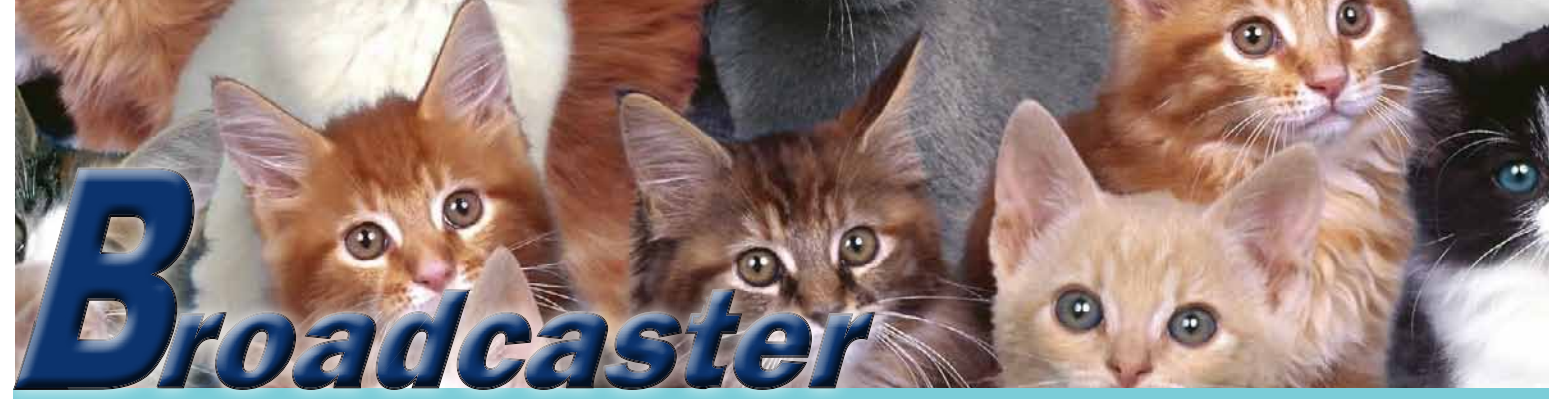
February 1, 2012